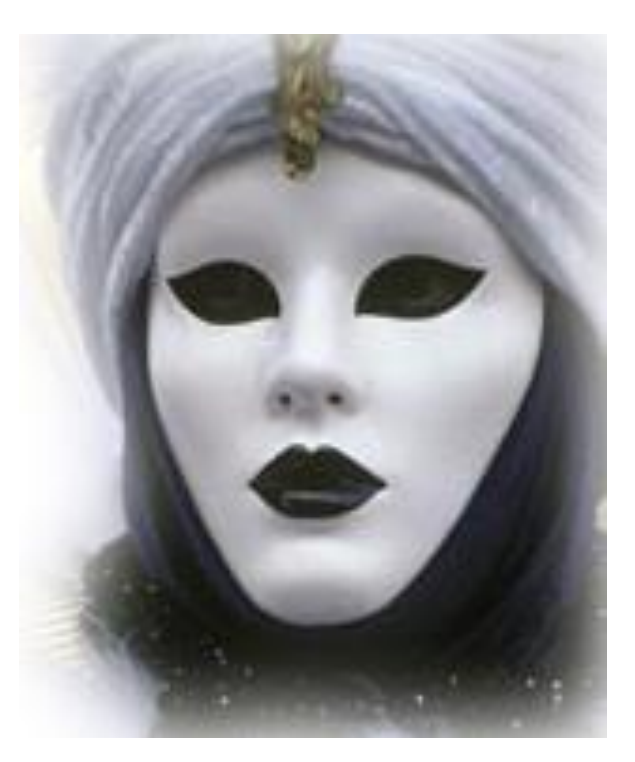
Lady in White Carnival of Venice - Wikipedia Italy