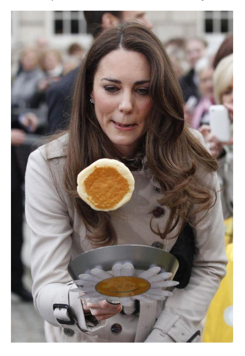
The Princess of Wales Catherine "Kate" Middleton Flipping Pancakes BBCAmerica

"In the United Kingdom, Ireland and parts of the Commonwealth, Shrove Tuesday is also known as Pancake Day or Pancake Tuesday, as it became a traditional custom to eat pancakes as a meal." -- Wikipedia