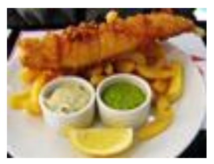
The Holy See" (The Vatican)

Refresher on the rules of fast and abstinence during Lent 2023