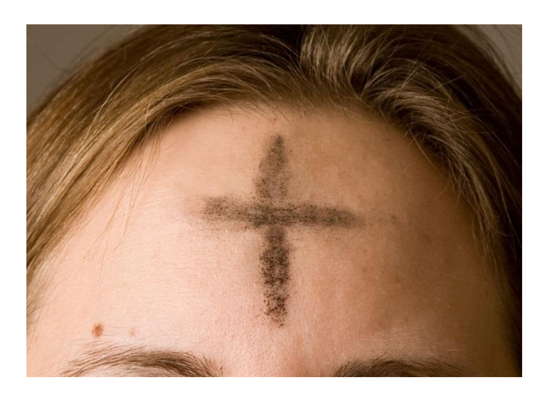
A cross marked in ash on a worshipper's forehead -- <u>Ash Wednesday</u> -- <u>Wikipedia</u>